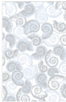
8086-N* 1/2 yd