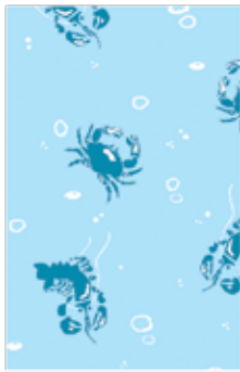
8087-T* 1/2 yd