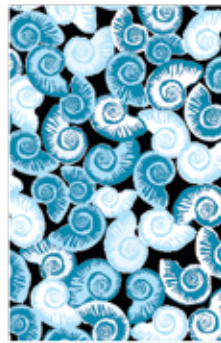
8086-T* 5/8 yd (includes binding)