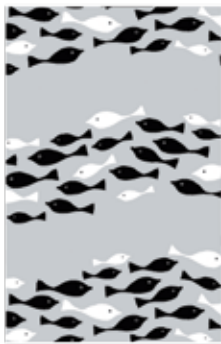
8083-N** 3/4 yd