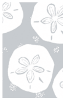
8084-N* 1/2 yd