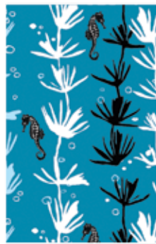
8082-T** 2 yds