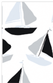
8080-N* 1/2 yd