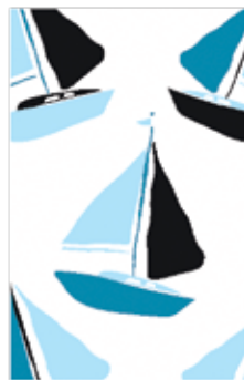
8080-T* 3 1/2 yds (includes backing)