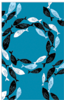
8085-T* 3/4 yd