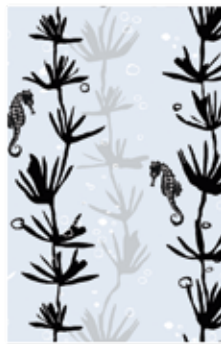
8082-N** 2 yds