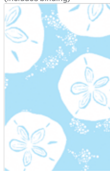
8084-T* 1/2 yd